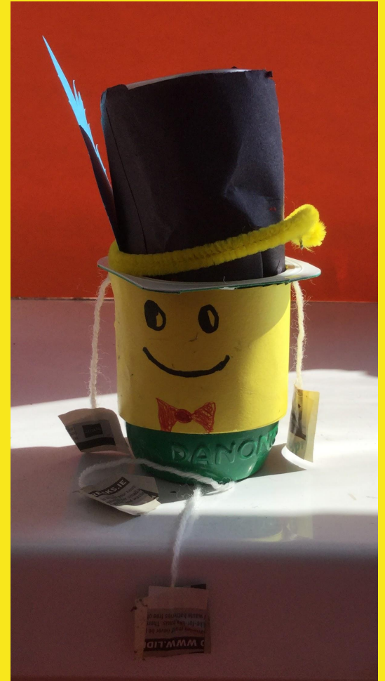
Alfred the puppet