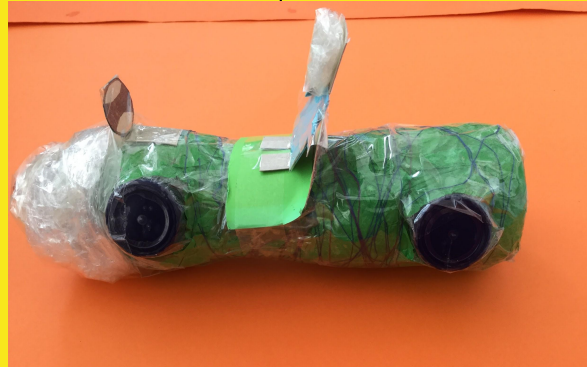
A racing car, vroom vroom...