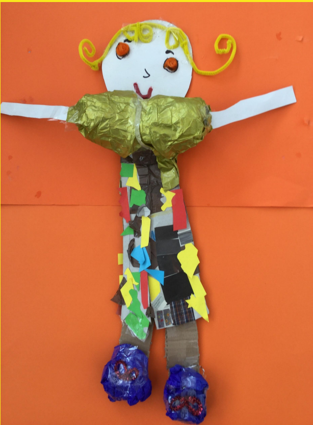
Our model Dublin Denver is wearing a high fashion multicoloured dress made from cardboard, plastic bottles and left over art paper